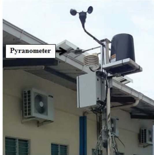
Figure 1. Weather station at Kompleks Makmal FKM UTeM

Pyranometer has been installed with weather station at Kompleks Makmal Fakulti Kejuruteraan Mekanikal, Universiti Teknikal Malaysia Melaka, Ayer Keroh as in Figure 1. The station is set to record the solar radiation, temperature, wind speed, wind direction, and humidity at every second. By using recorded temperature, the daily solar radiation estimated by using Hargreaves method is compared with the solar radiation recorded by Pyranometer (Daut et al., 2011; Feuermann & Zemel, 1993; Syafawati et al., 2012).